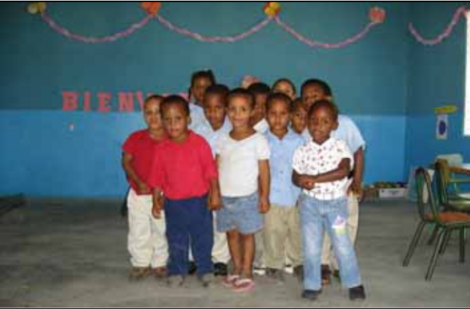
Preschool children in their new classroom at Los Miches. They had so much fun with the digital camera!