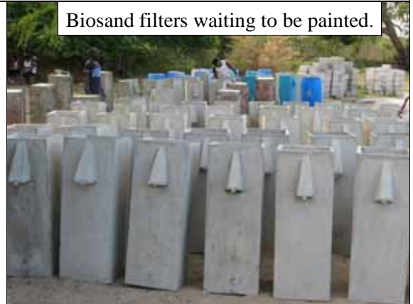
Biosand filters waiting to be painted.

International Aid has announced the manufacture of the plastic Biosand filter. These plastic filters will be introduced into the Dominican Republic within the next two months through another organization. Although the plastic filters have many disadvantages in comparison to the concrete filter, their one big advantage is ease of transport. Thus, if these plastic filters cost dramatically less than concrete filters in the D.R., or are given away by donor agencies, our filter technicians may be out of work. As you can imagine, the technicians and their employees are feeling quite nervous. I am unable to do much other than encourage them to keep their quality high, continue to believe that Rotarians and others will start to champion micro-financing as opposed to hand-outs, and ask to be involved in a consumer satisfaction study (eg. study 40 households, 20 with concrete and 20 with plastic filters, in the same community). Unless the costs are vastly different, I believe the concrete filter would come out on top if this kind of study were undertaken. Add Your Light would not be seen as totally objective, so the study might have to be done by someone else. But first, let’s see how prices compare. Stay with us as we ride this wave!