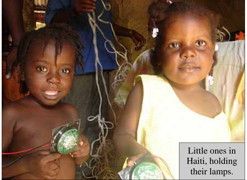
Little ones in Haiti, holding their lamps.